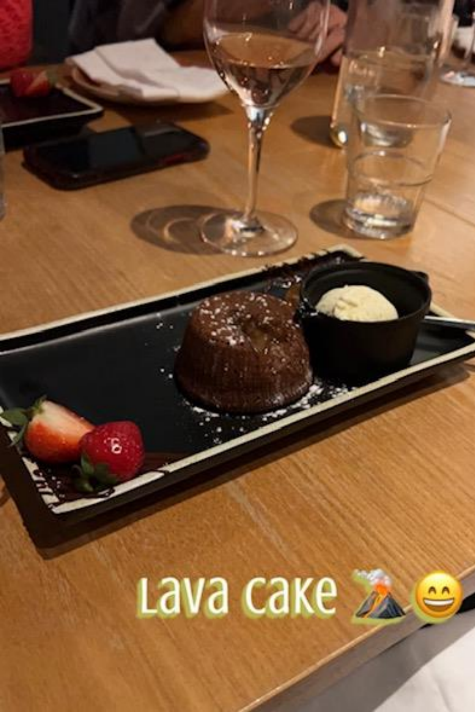
Lava cake 🌋 😊