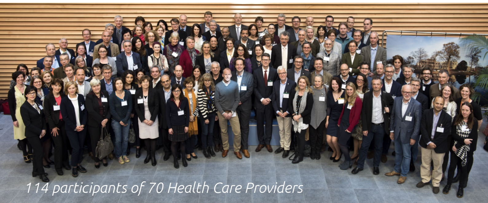
114 participants of 70 Health Care Providers

Newsletter April 2017 about the first General Assembly